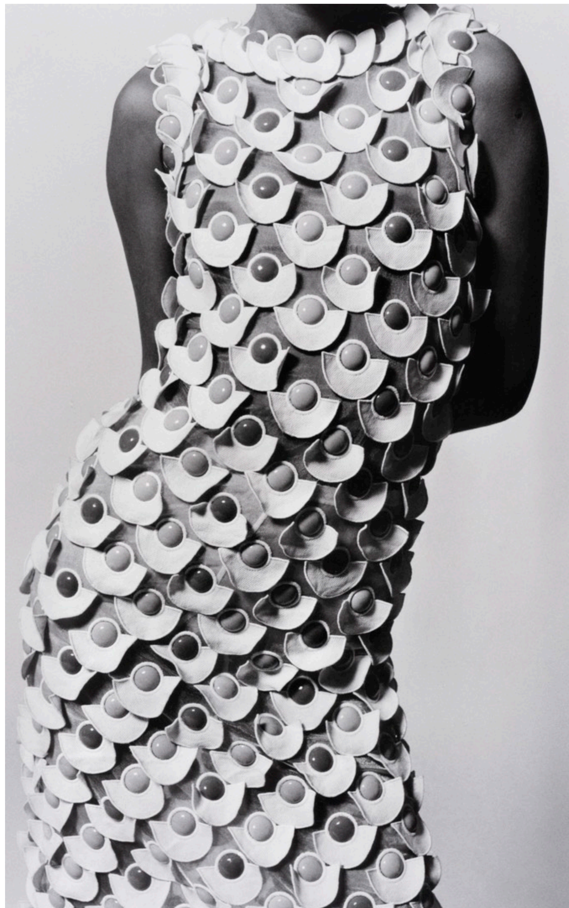
Paris, Ungaro, Jakob Schläpfer, embroidery Stern, 1967

Through Compte à rebours, 2024–1960 , the Oana Ivan Gallery celebrates an artist whose legacy continues to resonate in contemporary creation. The walls of 93 rue du Faubourg Saint-Honoré become the stage for a body of work that, from the cobblestone streets of Paris to Mediterranean shores, tells the story of women's emancipation and the liberation of the body.